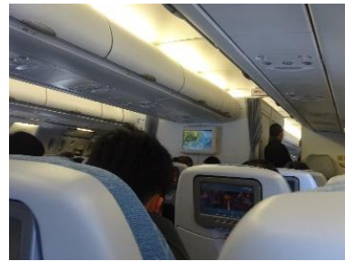
On the airplane