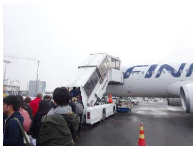
Get on the airplane for London