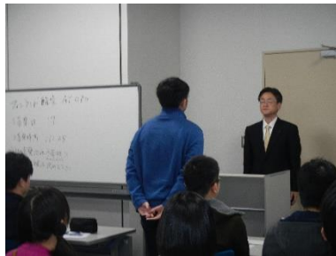
Team formation ceremony