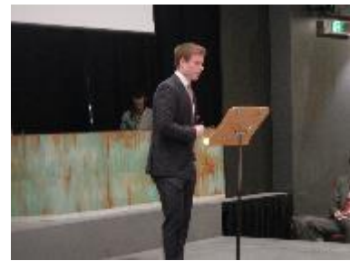
Oral Presentation Session

After the presentation session, we had a poster session. We were nervous when we made presentations, but students from other countries seemed to have no difficulties. We learned that we should not hesitate to make mistakes and we should communicate positively. It is certain that we learned a lot. We hope we will make full use of today's experience.